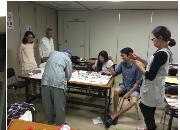
Agreeable but not following blindly 和して同ぜず